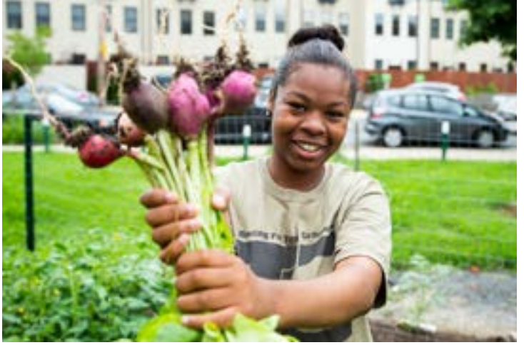
An urban farmer in Philadelphia connecting urban agriculture to climate change solutions.