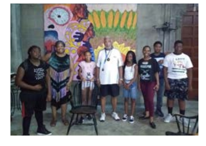
Participants in the Community Climate Change Connectors summer camp.

Project partners collectively designed a hands-on tabletop activity that illustrates the role trees play in preparing residents for a hotter/wetter city. Leveraging the special role that block parties play in Philadelphia's culture, the activity challenges city residents to experiment with block-level solutions to make summertime temperatures more bearable and Save Sadie's Block Party!