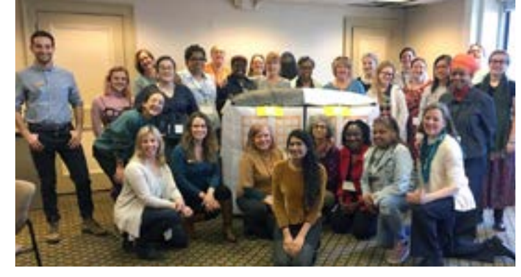
Teachers use the CUSP House of Holes to explore home insulation and energy usage.

In a summer 2018 expansion to a three-day workshop, teachers explored these topics further and learned how to implement project-based learning around climate change solutions in their classrooms. Participants visited the Philadelphia Water Works and Museum of Art, where curators demonstrated interdisciplinary connections of climate change.